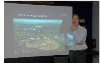
Above: Last year's Vibration Workshop

In the first half of last year we held a Vibration Workshop at which independent expert presenters explained the practical science behind vibration and its effects. Our underground manager also worked through what we are doing underground and how we do it.