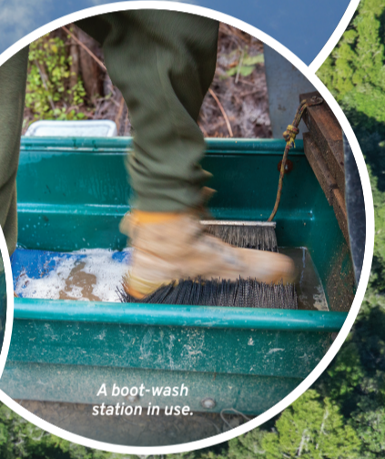
A boot-wash station in use.