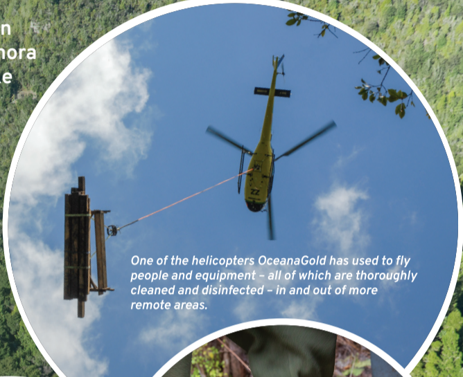
One of the helicopters OceanaGold has used to fly people and equipment – all of which are thoroughly cleaned and disinfected – in and out of more remote areas.

Taking a moment to clean your gear when you enter and exit a forest makes all the difference, and keeping on the tracks and away from kauri roots helps to ensure those same kauri can remain standing for future generations to see.