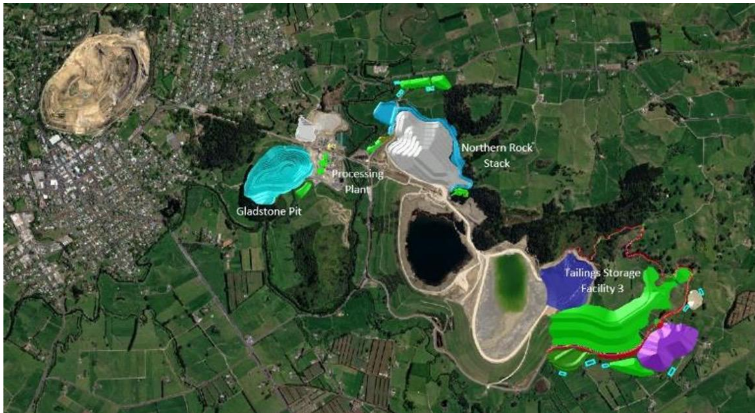
Figure 2. WNP proposed expanded Waihi operations – Gladstone Open Pit (GOP), Processing Plant, Northern Rock Stack (NRS) and TSF3 Storage Facility