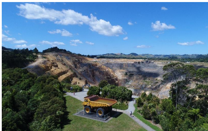
Above left: A tunnel in the Correnso underground mine. Above right: The Martha open pit is close to the main street of Waihi.